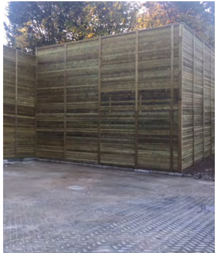
Jakoustic® Commercial and Highway Fencing

For further information on products featured visit: www.jacksons-security.co.uk