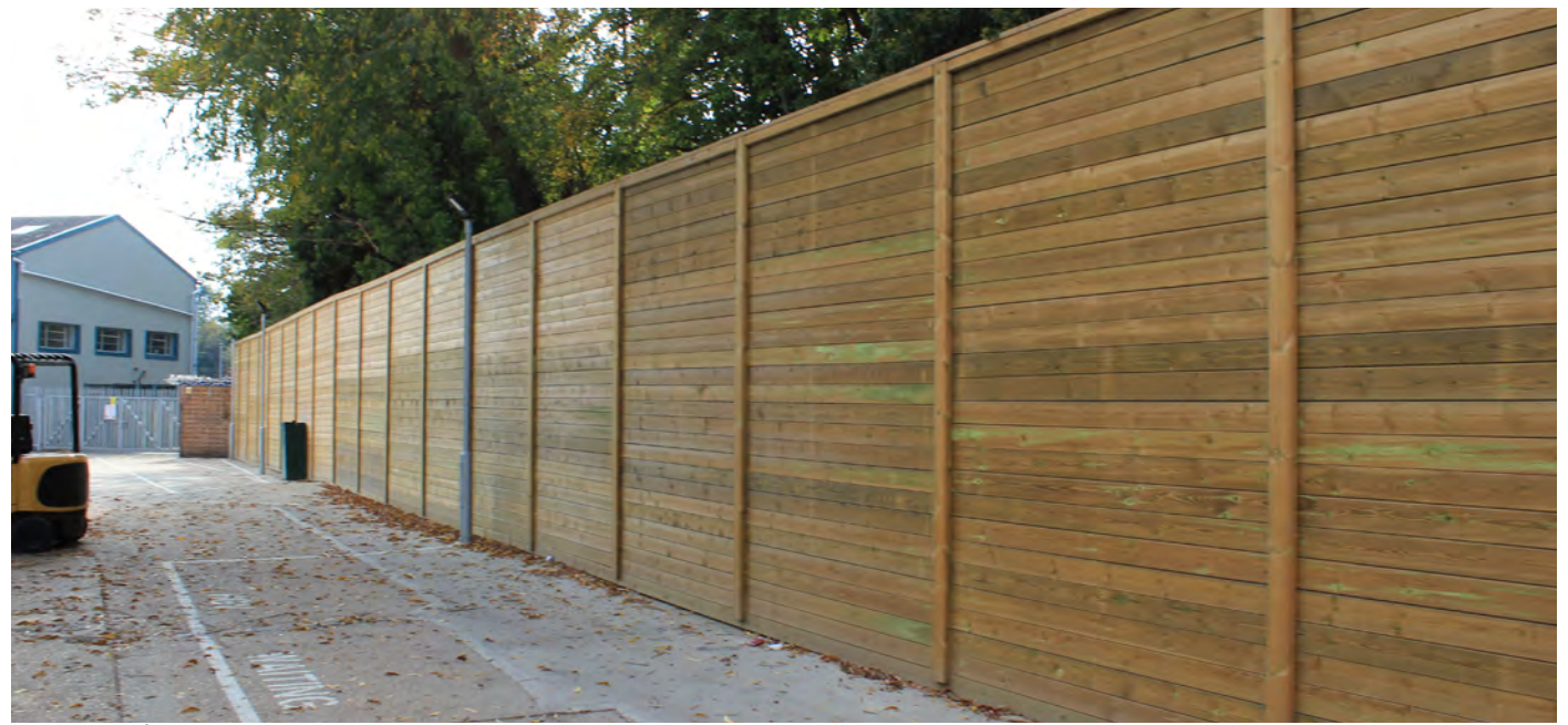
Jakoustic® Reflective Barrier

To alleviate noise disturbances and light pollution to local residents, the decision was made to replace the existing mesh fence with an acoustic fence on the northern boundary located nearest to the residential properties.