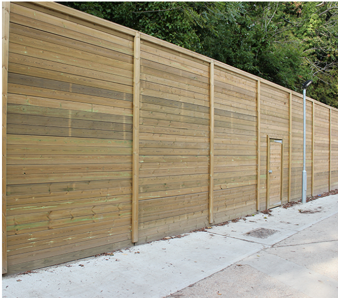
Jakoustic® Reflective Barrier

For further information on products featured visit: www.jacksons-security.co.uk