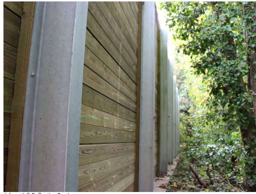
Jakoustic® Reflective Barrier

*Jakoustic® barrier certified laboratory results: Rating according to BS EN 1793-2:1998 Category = B3 Laboratory sound reduction 28 dB Superficial mass 25kg/m