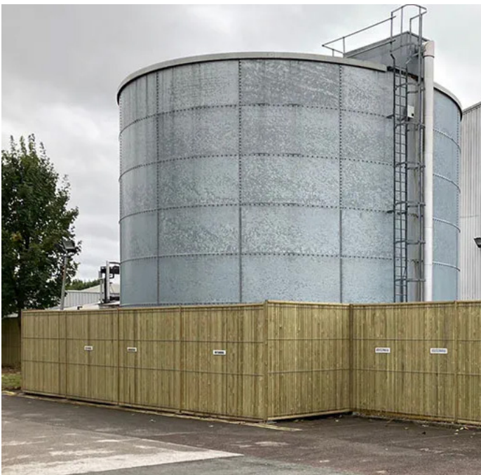
EuroGuard® Combi around silo

We recently installed our Jakoustic® Absorptive acoustic barriers at a polymer compounding company in Lancashire.