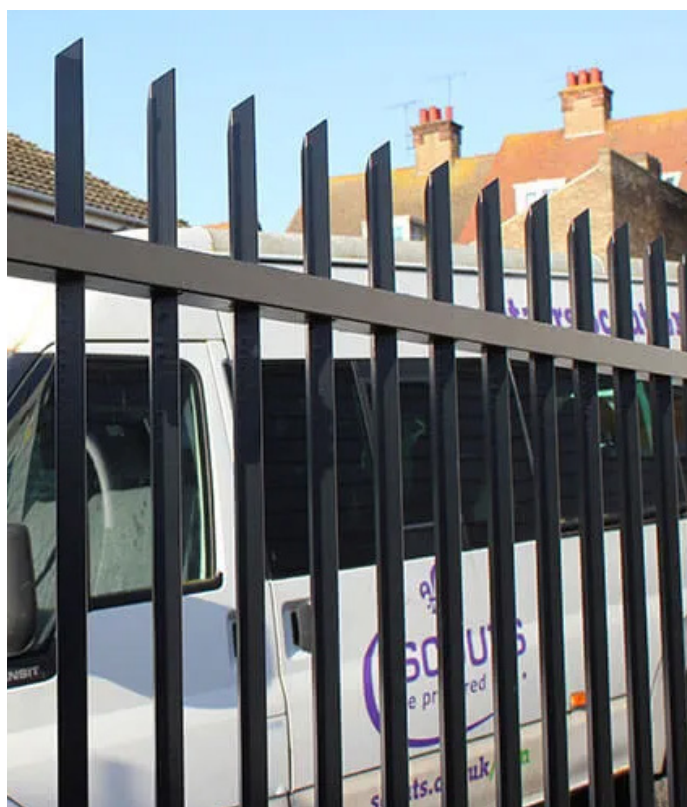
Barbican® vertical bar railings

For further information on products featured visit: www.jacksons-security.co.uk