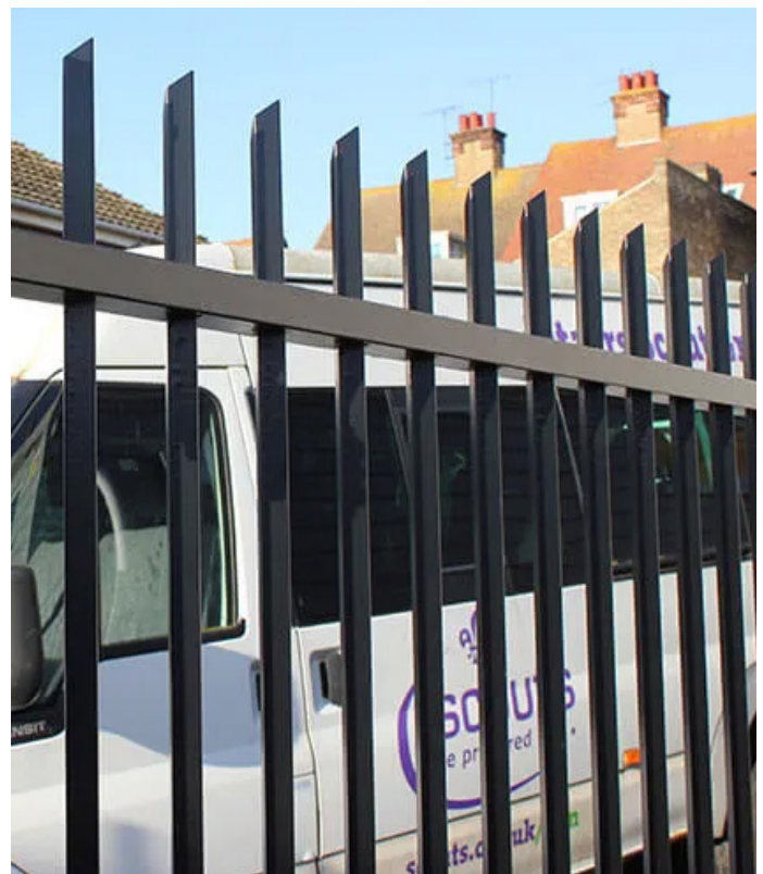
Barbican® vertical bar railings

For further information on products featured visit: www.jacksons-security.co.uk