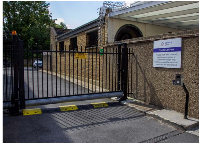
Automated 3m wide sliding gate

For further information on products featured visit: www.jacksons-security.co.uk