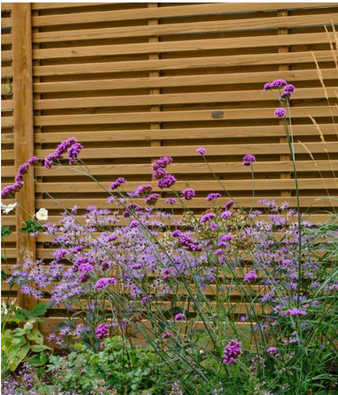
Venetian Hit & Miss Fence Panels