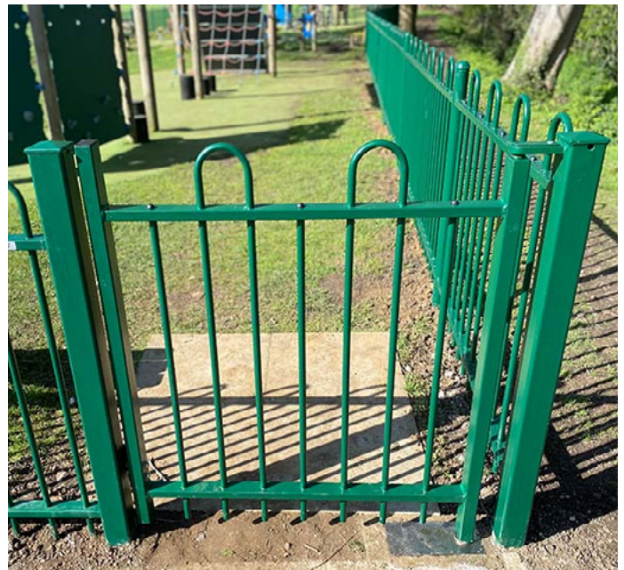
Self closing Anti Trap Bow Top gate

For further information on products featured visit: www.jacksons-security.co.uk