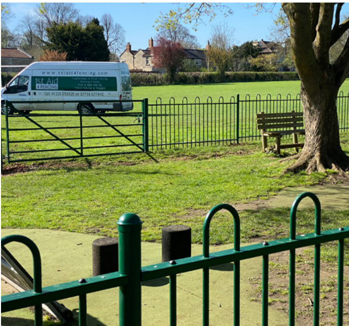
Anti Trap Bow Top fencing with 3.0m wide Metal Field gate in background

Quote from 1st Aid for Fencing "Holt Parish Council are very pleased with the upgrade and so are the park users. We received copious positive comments while carrying out the installation."