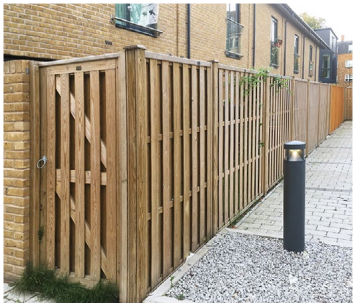
Hit & Miss fencing and gate