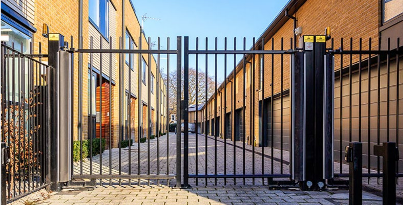
Barbican Imperial® gate

In the garden areas timber Hit and Miss fencing was installed, providing a warm and welcoming aesthetic, the Hit and Miss fencing is made up of contemporary slatted pales enhancing both privacy and security and guaranteed against rot and insect attack for 25 years.