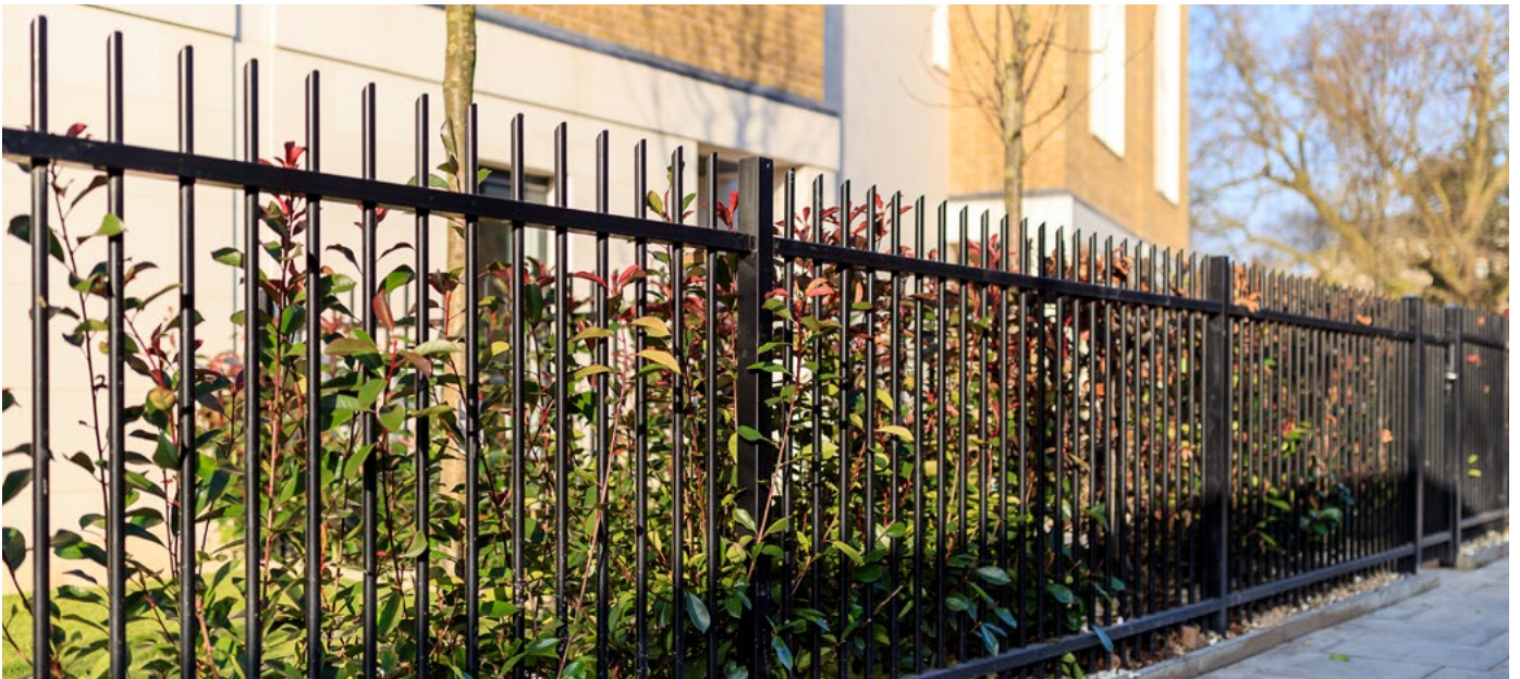
Barbican Imperial® fencing

For further information on products featured visit: www.jacksons-security.co.uk