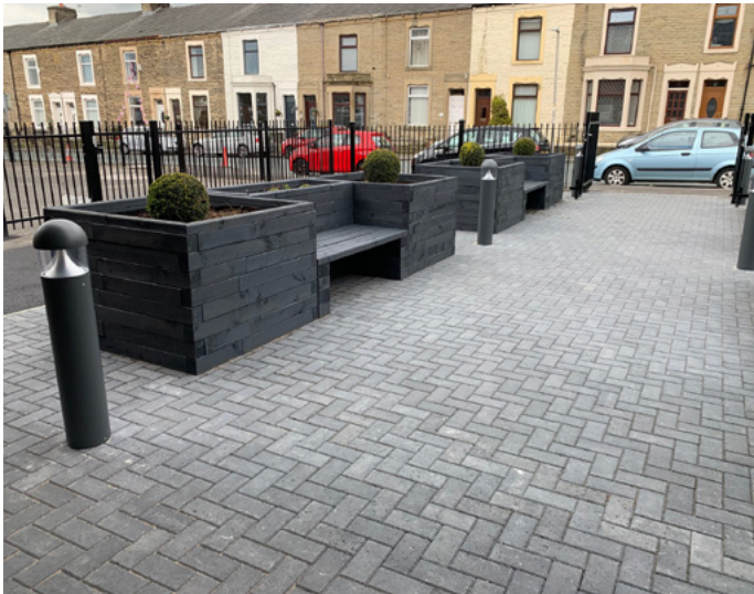
Barbican Imperial® fencing and gate

For further information on products featured visit: www.jacksons-security.co.uk