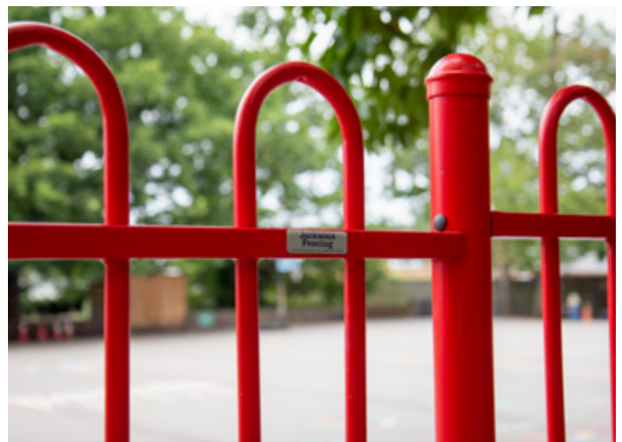
Bow Top hoop detail

For further information on products featured visit: www.jacksons-security.co.uk