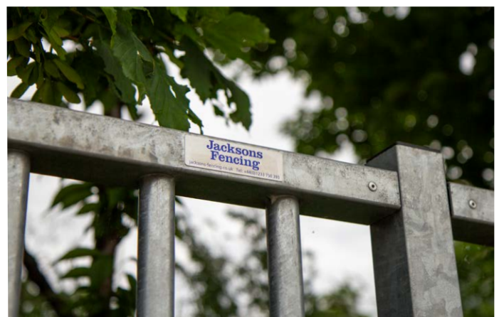
Sentry galvanised fence panel detail

For further information on products featured visit: www.jacksons-security.co.uk