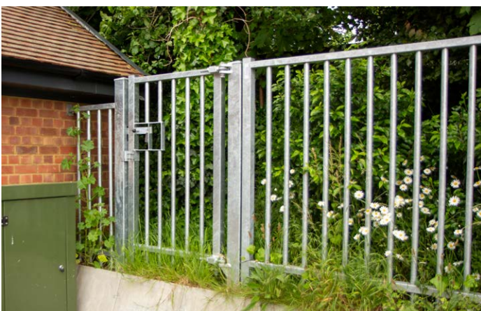
Sentry single leaf access gate

We have worked on many bus station and depot projects. If you have a requirement for bus station fencing or fencing and access control for another transport project, contact our experienced team.