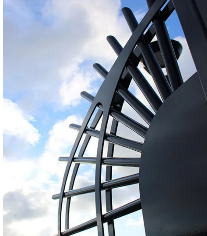
Black Barbican® Fan Panel

For further information on products featured visit: www.jacksons-security.co.uk