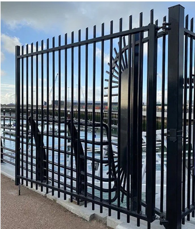
Black Barbican® Double Leaf Gate

To prevent climbing around the gate, our Barbican® fan panels were installed next to the gates, their decorative appearance providing a non-intimidating deterrent that fits with the surrounding environment. Our Barbican® range includes a number of styles that carry the same principles throughout: tamper proof fixings, anti-climb designs, welded pale-through-rail construction, and concealed panel-to-post connectors. Find out more about the range here.