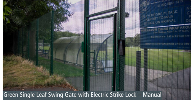
Green Single Leaf Swing Gate with Electric Strike Lock – Manual