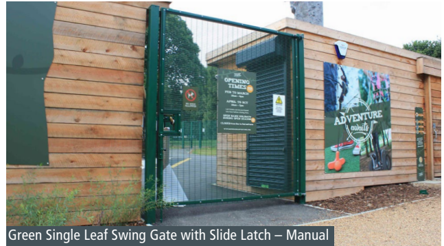
Green Single Leaf Swing Gate with Slide Latch – Manual