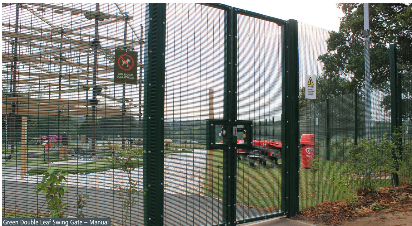
Green Double Leaf Swing Gate – Manual

Our Securi-Mesh® gates provide high-security performance with anti-climb welded mesh, available in custom heights up to 3m to meet your specifications. Offering durability, visibility, and corrosion resistance, they are ideal for providing controlled entry to sensitive sites, and perfectly match our Securi-Mesh® fence panels.