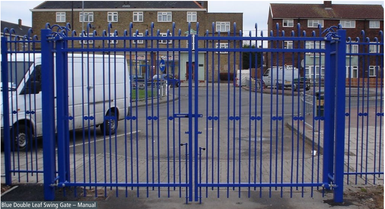
Blue Double Leaf Swing Gate – Manual

Tri-Guard® gates are stylish and secure with distinctive triple-cluster pales, curved tops, and decorative steel discs. Combining anti-climb and anti-scale features, Tri-Guard® offers robust performance and aesthetics. Made from galvanised tubular steel, these gates are lightweight and decorative, yet strong and secure. They perfectly complement our Tri-Guard® fencing system.