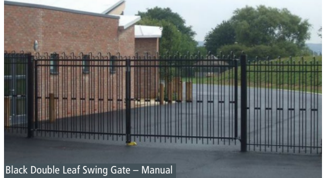
Black Double Leaf Swing Gate – Manual