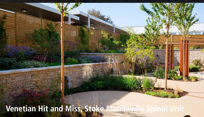
Venetian Hit and Miss, Stoke Mandeville Spinal Unit