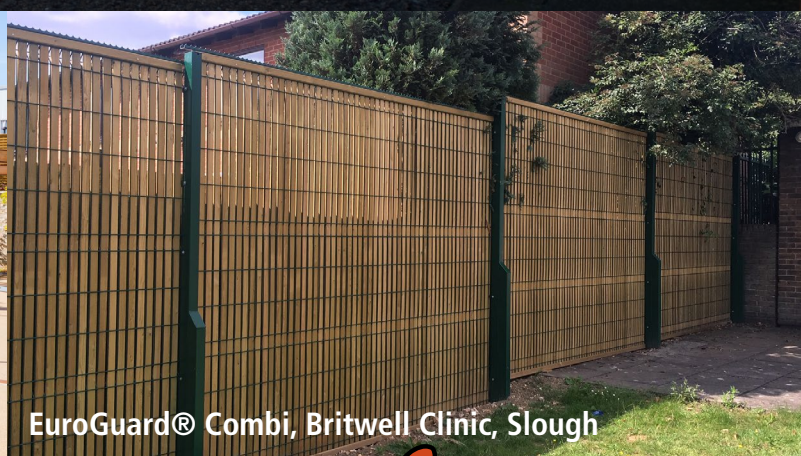
EuroGuard® Combi, Britwell Clinic, Slough