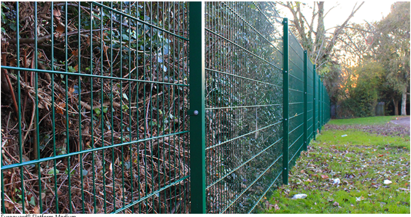
Euroguard® Flatform Medium

As part of their commitment to safeguarding the school, they decided to update their perimeter fencing which had succumbed to age and no longer provided optimal security. Jacksons were chosen to the secure the site and worked closely with M&J Construction to ensure the project was delivered.