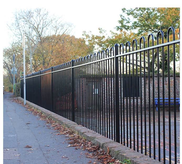
Bow Top Fencing

For further information on products featured visit: www.jacksons-security.co.uk