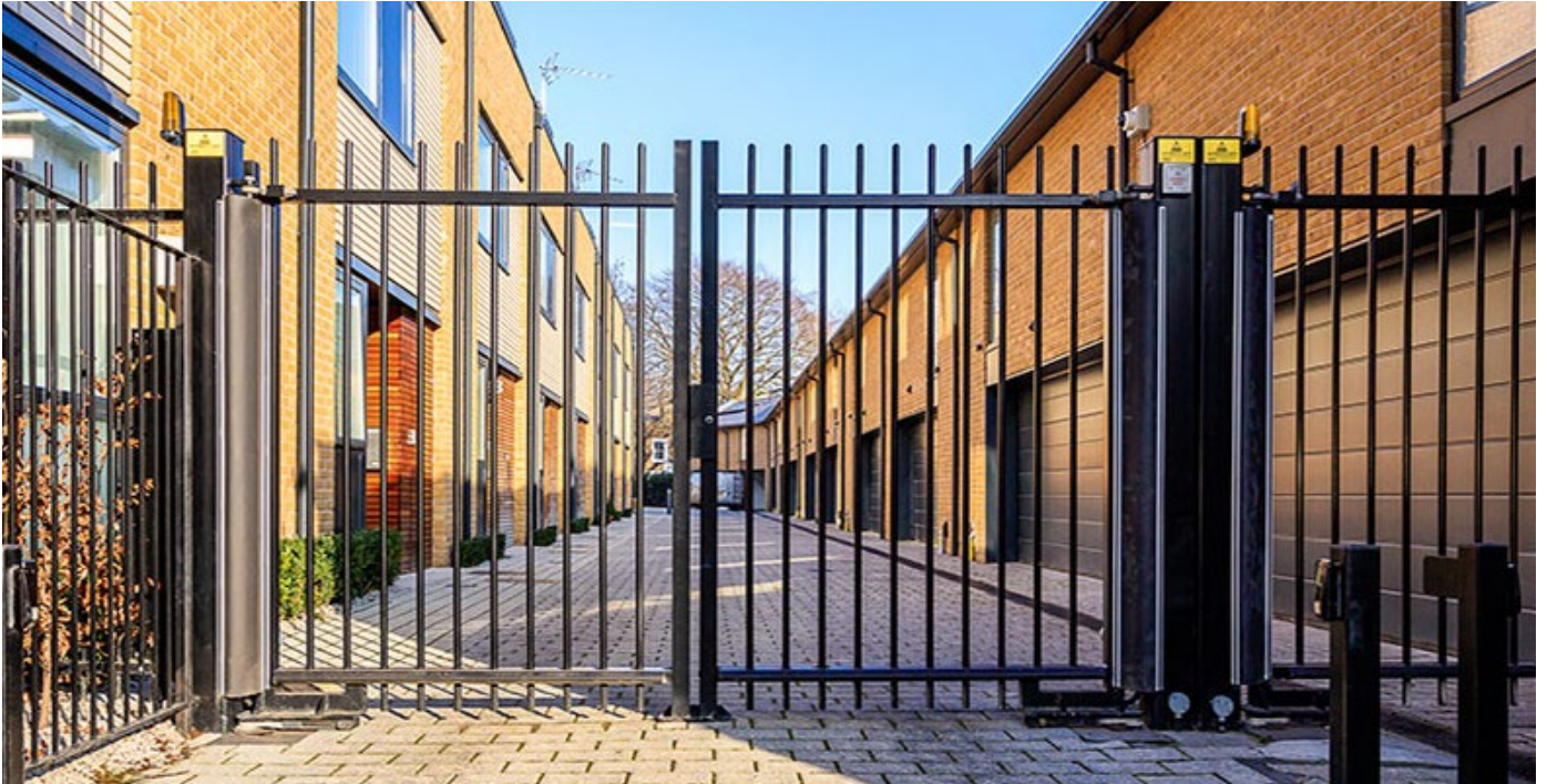
Barbican Imperial® gate

In the garden areas timber Hit and Miss fencing was installed, providing a warm and welcoming aesthetic, the Hit and Miss fencing is made up of contemporary slatted pales enhancing both privacy and security and guaranteed against rot and insect attack for 25 years.