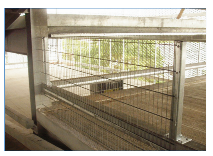
EuroGuard panel infill

Jacksons Fencing Head Office Stowting Common Ashford Kent TN25 6BN 0800 41 43 43 info@jacksons-fencing.co.uk www.jacksons-fencing.co.uk www.jacksons-security.co.uk www.gate-safe.co.uk