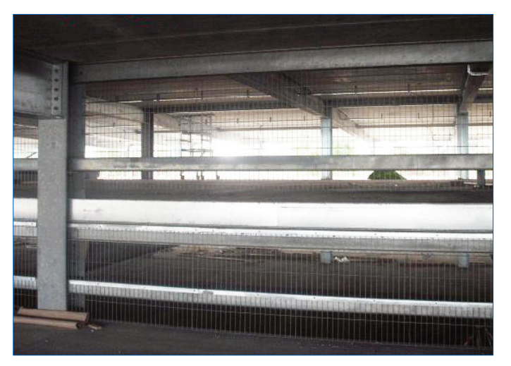
EuroGuard panel infill