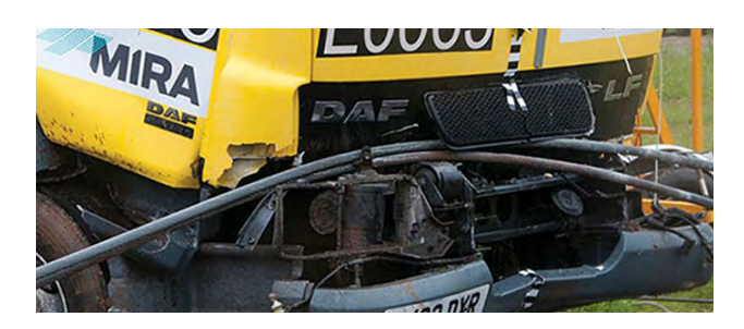
In the UK it is PAS 68, a standard introduced in 2005. In mainland Europe, CWA 16221 has been applied since 2010. In the USA, the ASTM F2656 standard has progressively taken over from the Department of State's 'K' ratings.

There are currently a number of standards and agreements in operation for the certification of Hostile Vehicle Mitigation (HVM) measures against a Vehicle Borne Improvised Explosive Device (VBIED).