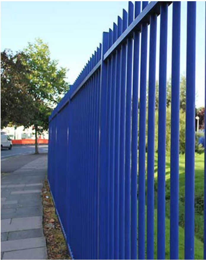
Barbican Imperial® Fencing

Chosen for its classic look and to secure the roadside perimeter, 2.4m high Barbican Imperial® was installed in RAL 5002 Blue to match the Access Self Storage brand colours. The round pale security fencing offers both strength and security whilst also fitting in with the surrounding residential and commercial properties.