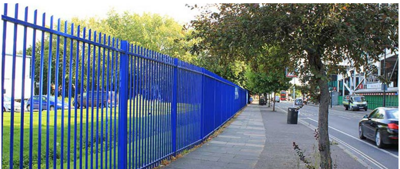
Barbican Imperial® Fencing

Jacksons Fencing were specified to install of Barbican Imperial® fencing and gates combined with EuroGuard® Regular Mesh in order to improve access control and perimeter security at the site.