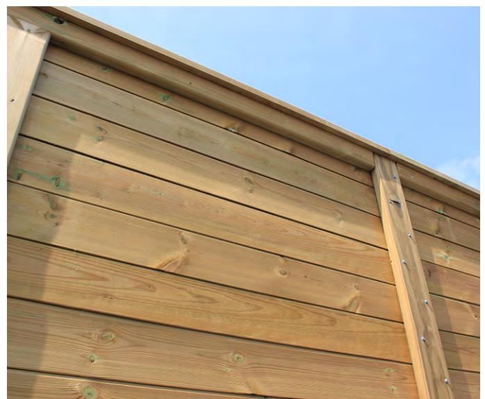
12k Envirofence Acoustic Barrier

For further information on products featured visit: www.jacksons-security.co.uk