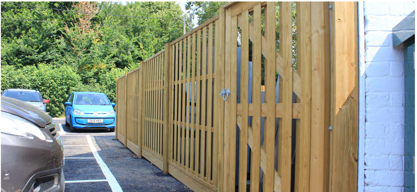
Hit & Miss Vertical Timber Fencing

To provide access to and from the bin store area a 2.4m wide matching manual double leaf gate was installed, a 1.2m wide manual single leaf gate was also installed at the rear of the building to provide access control for staff members.