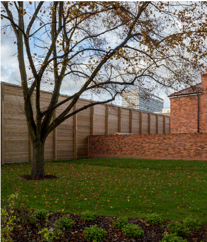
Jakoustic® Reflective fencing

As well as providing a reduction in noise, is the Jakoustic® barrier offers residents increased security with its anti climb properties and sheer height. The barrier is backed by a 25-year guarantee with our timber treatment process, which will benefit the developers and residents with lower lifetime costs.