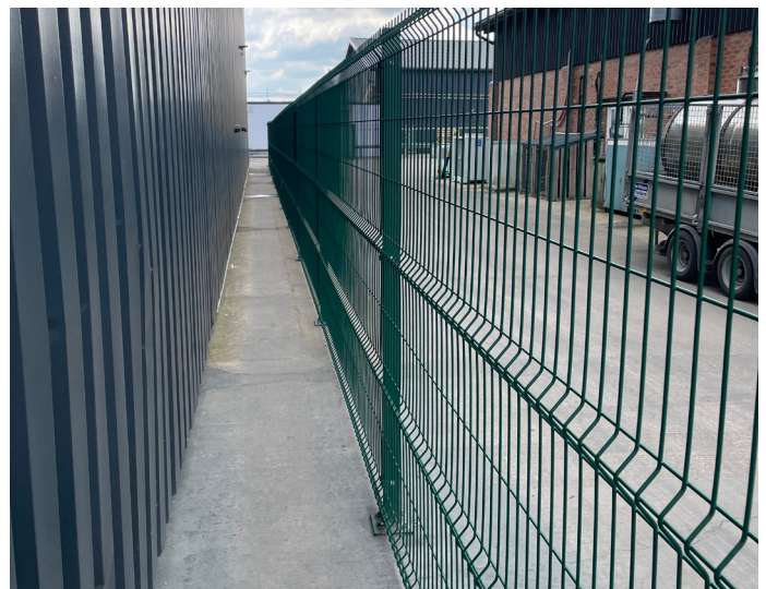
EuroGuard® Regular along pedestrian walkway

For further information on products featured visit: www.jacksons-security.co.uk