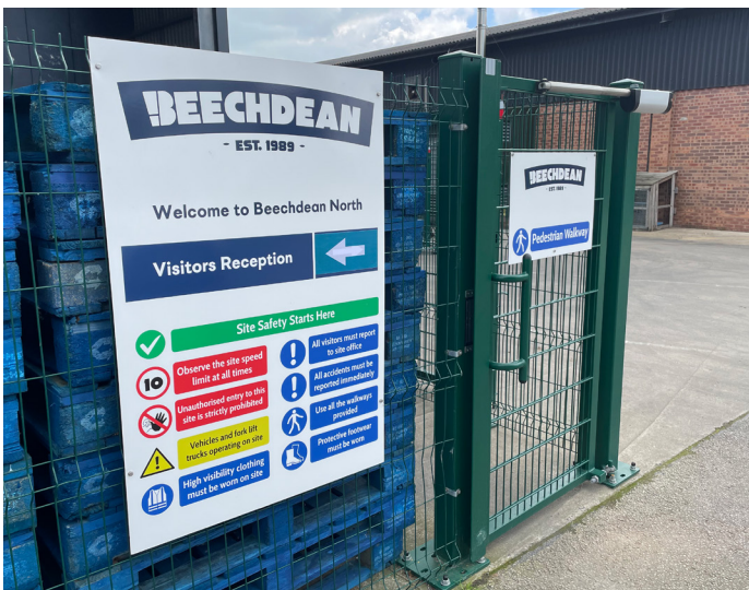
EuroGuard® Regular pedestrian gate

In addition to the large double-leaf gates, the installation also incorporated 5m and 1m wide matching single-leaf gates to facilitate access to smaller outside areas and provide convenient pedestrian entry. The 1m pedestrian gate was installed to open outward for ease of entry and fitted with a mechanical keylock as an additional security measure.