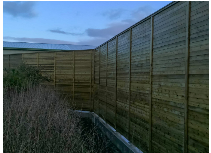
Jakoustic® Commercial and Highway acoustic barrier

For further information on products featured visit: www.jacksons-security.co.uk