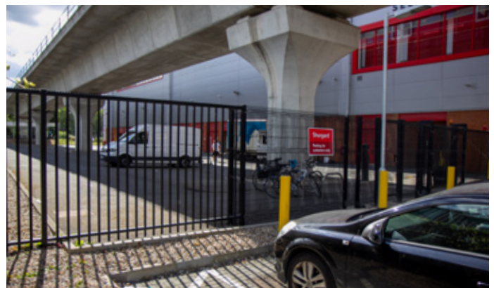
Sentry® with Security Comb