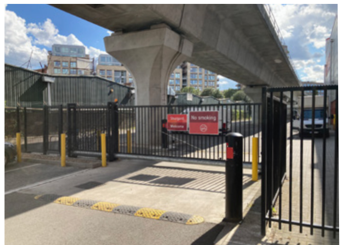
Sentry® fencing and automated cantilever sliding gate

For further information on products featured visit: www.jacksons-security.co.uk