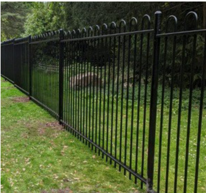
Bow Top Fencing Powder Coated In Black RAL 9005

All of our fencing including our bow top fencing is guaranteed for 25 years against rust, corrosion, and manufacturing defects, the longest guarantee on the market for steel fencing.