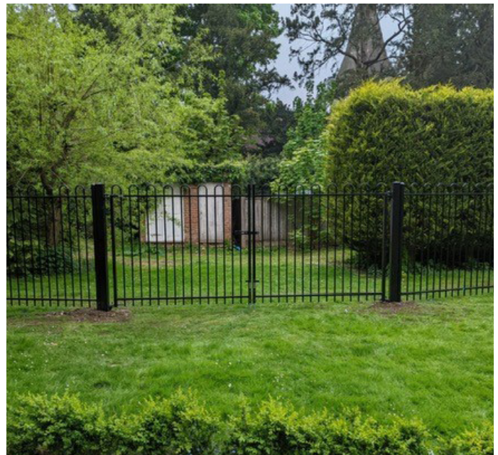
Double Leaf Bow Top Gate

For further information on products featured visit: www.jacksons-security.co.uk