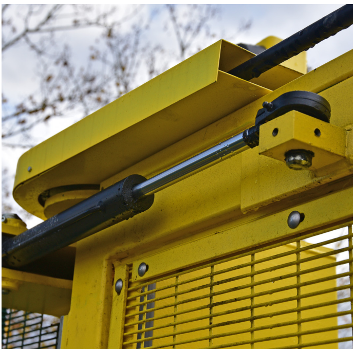
Bi-Folding gate detail

A big thank you to the ambulance service and the NHS for all your amazing work throughout the pandemic and beyond, from Jacksons Fencing.