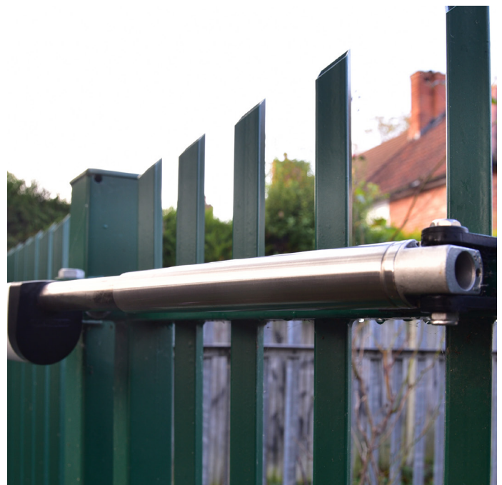
Swing gate detail

For further information on products featured visit: www.jacksons-security.co.uk