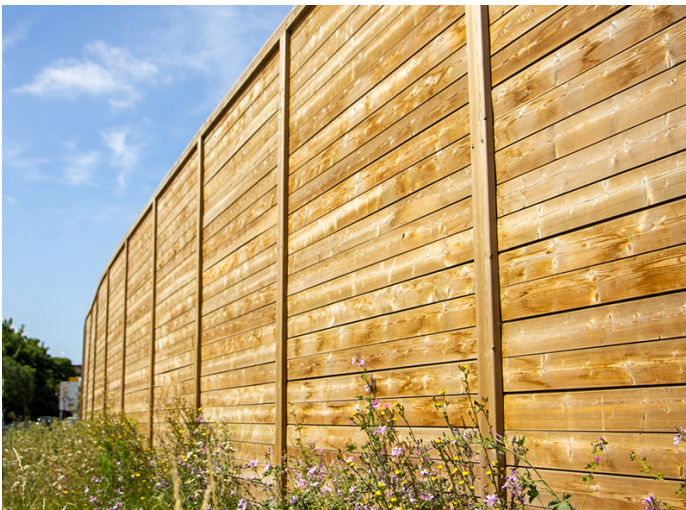
Jakoustic® Commercial and Highway Reflective barriers along roadside

When looking at specifying acoustic barriers for a site we always suggest a noise engineer or acoustic consultant surveys the area and if possible, choose fencing with a long guarantee such as our 25-year guarantee.