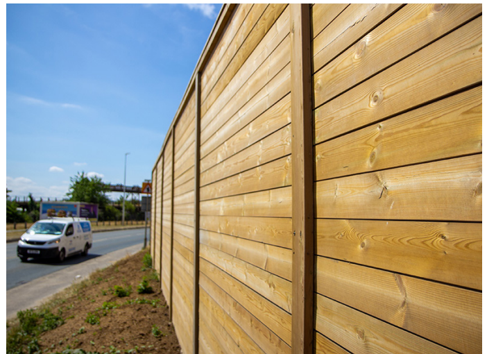
Jakoustic® Commercial and Highway Reflective barrier detail

For further information on products featured visit: www.jacksons-security.co.uk