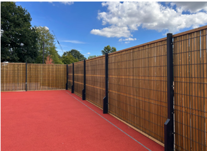
EuroGuard Combi fence panels

The steel mesh panels that make up the fencing were polyester powder coated green to further protect them from rust while the timber slats of the fence were kiln dried and pressure treated to prevent insect attack and rot. The fencing and gates were provided with a 25 year guarantee on both the timber and steel components, ensuring a low lifetime cost and value for money, and contributing to the sustainable goals of the development.