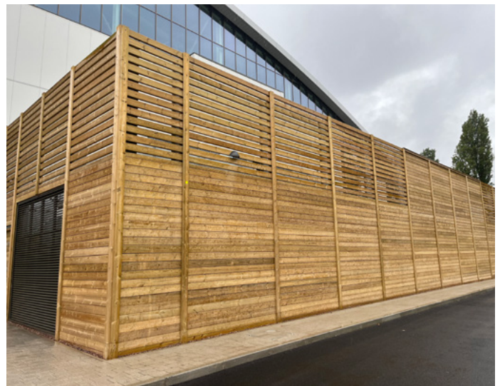
Jakoustic® Reflective acoustic barriers

For further information on products featured visit: www.jacksons-security.co.uk